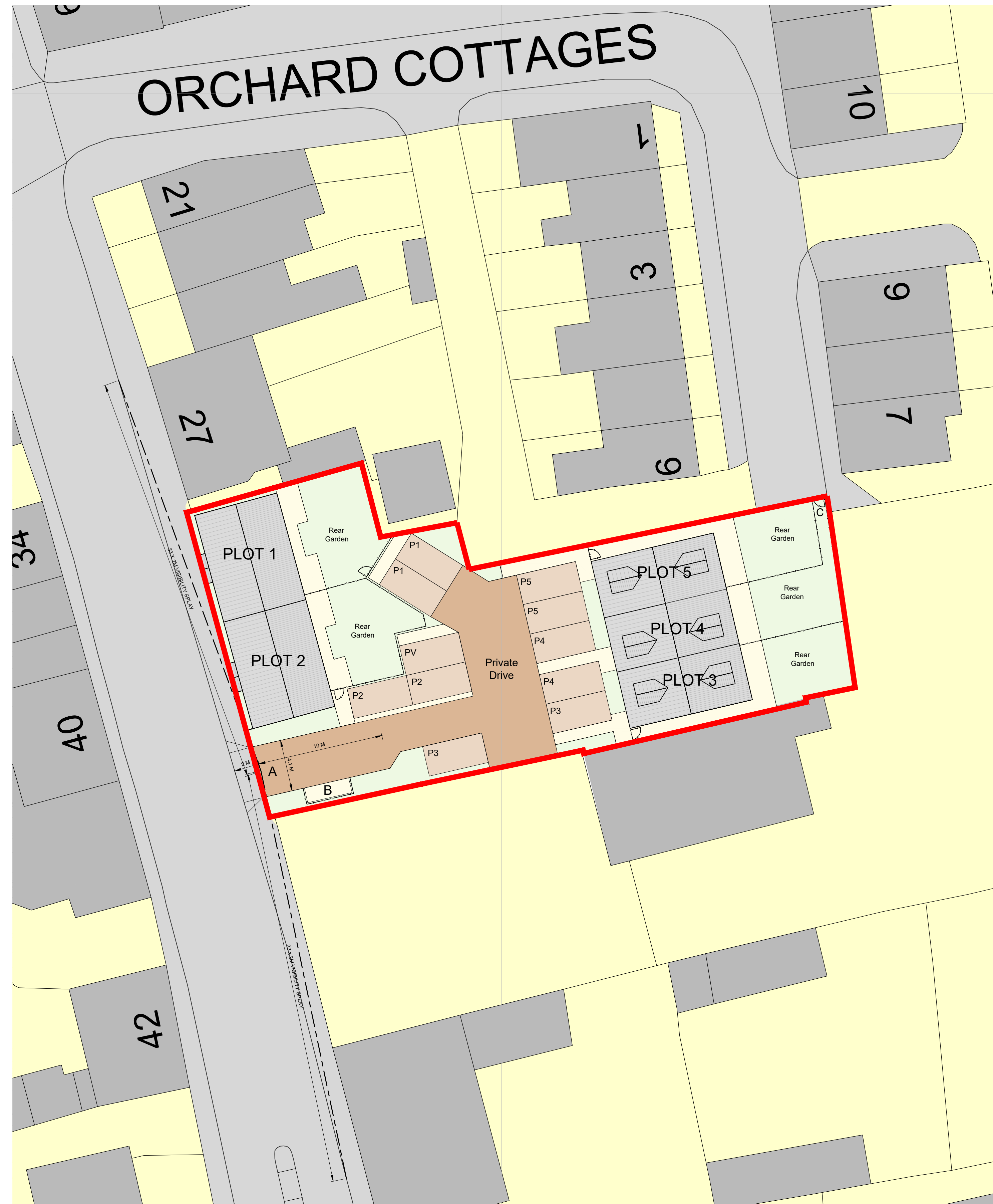
PROPOSED BLOCK PLAN 1:200